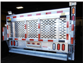
2000 lb. liftgate with heavy duty steel frame and aluminum platform. Self locking two-point spring loaded lock system locks platform closed when stored for travel. Optional self locking tire stacking rack on platform.