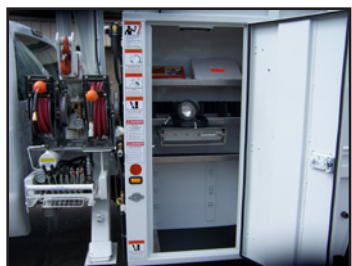
Large tool compartments are available for locked tool storage.