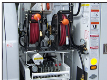
Hose reels commonly placed on left side above the crane controls. 1/2" X 50' and 3/8" X 50' heavy duty reels with hose end guard,