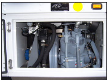
H65 air compressor with PTO/hydraulic or diesel engine drive. 60 CFM with a 23 or 35 gal. tank. Available under floor (shown) or in bed.

The Spartan Mini Plus OTR service vehicle is available in lengths of 13' and 15'. Our unique modular construction utilizing aircraft-grade fasteners allows this workhorse to stay flexible, yet durable. It also allows the body to be repaired quickly in the case of an accident, minimizing downtime. Most body parts and tool boxes can be unbolted and quickly changed with pre-painted replacements to keep you working. Your customers demand the best, so should you.