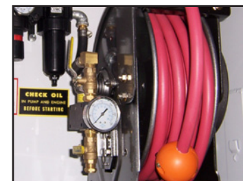
Optional airing station for easy tire inflation.